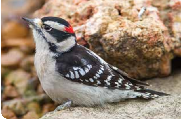
Bird Feeder Faves: Suet, peanuts, sunflower seeds Wild Menu: Insects, acorns

When a downy woodpecker is angry at another bird, it fans out its tail and swings its beak like a sword.