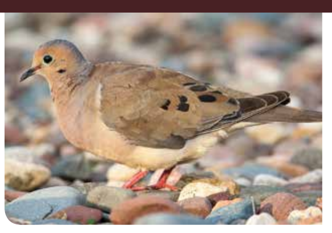
Bird Feeder Faves: Cracked corn, millet, sunflower seeds Wild Menu: Weed and grass seeds

When a mourning dove takes flight, its wings make a whistling sound.