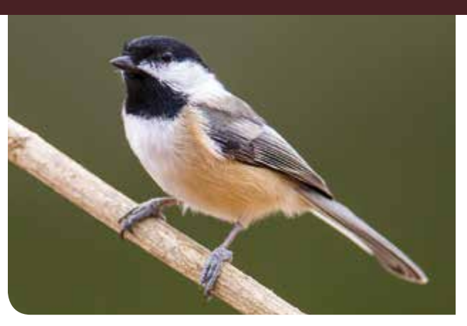
Bird Feeder Faves: Sunflower seeds, peanuts, suet Wild Menu: Insects, spiders

When a chickadee spots danger, it gives an alarm call to warn other birds: chickadee-dee-dee. The more dees, the bigger the danger.