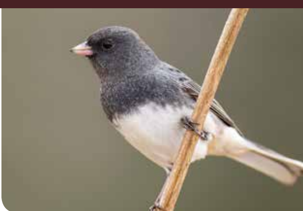
Bird Feeder Faves: Millet, sunflower seeds, cracked corn

Wild Menu: Mostly weed seeds but also a few insects