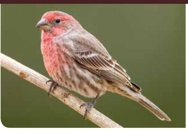
Bird Feeder Faves: Sunflower seeds, thistle, millet Wild Menu: Seeds, berries

Flocks of finches may stay at feeders a long time, eating tons of seeds and keeping other birds from taking a turn.