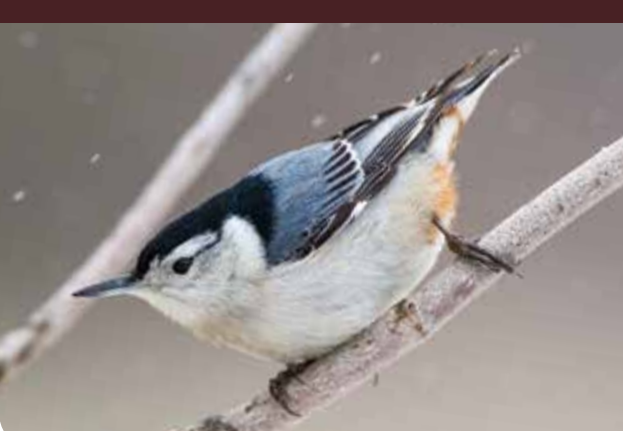
Bird Feeder Faves: Suet, sunflower seeds, peanuts Wild Menu: Insects, acorns, seeds

Though small, nuthatches are feisty. They often swing their long, sharp beaks like swords to drive away other birds. When this happens, only woodpeckers hold their ground.