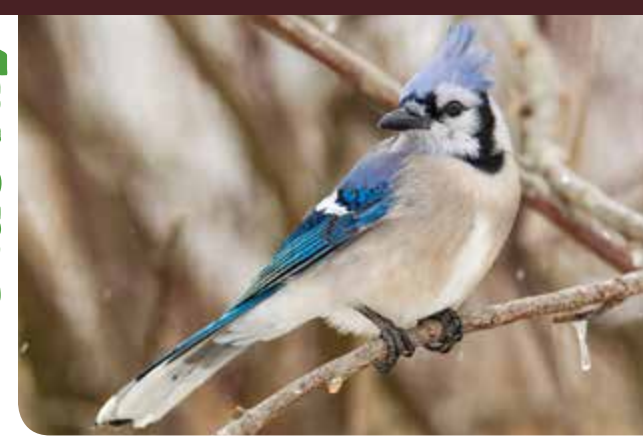
Bird Feeder Faves: Peanuts, sunflower seeds, cracked corn

Male house finches come in many shades, from yellow to orange to red. They get their color from pigments in the wild seeds they eat. Female house finches are brown.