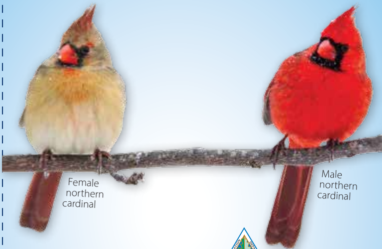
Female northern cardinal