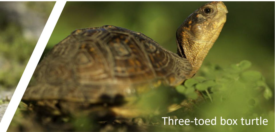
Three-toed box turtle