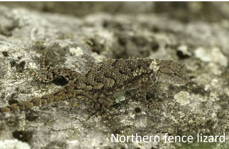
Northern fence lizard